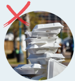
Polystyrene Containers (Styrofoam)